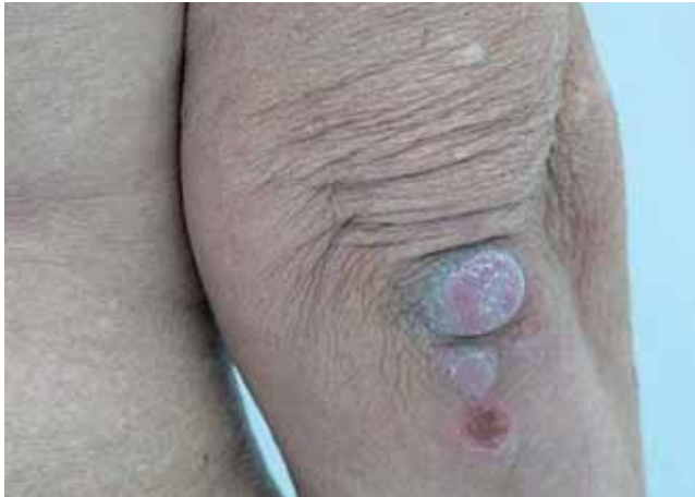
FIGURE 2: Hardened erythematous violaceous nodules and ulcerated nodule on the elbow