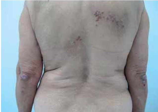
FIGURE 1: Erythematous violaceous papules grouped on the back and hardened symmetrical erythematous-violaceous nodules on the elbows