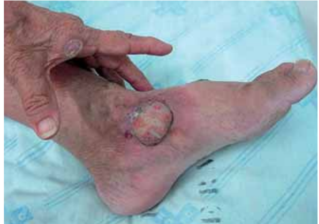
FIGURE 3: Ulcerated malleolar tumoral lesion and erythematous violaceous nodule on the lateral border of hand