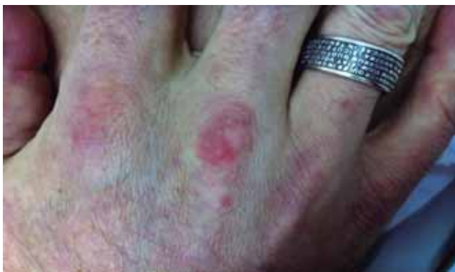
FIGURE 1: Psoriatic plaque on the third metacarpophalangeal joint, erythematous-violaceous papules on the right hand dorsum

The pathogenic mechanism for development of the TNF alpha antagonist-induced lupus-like syn-