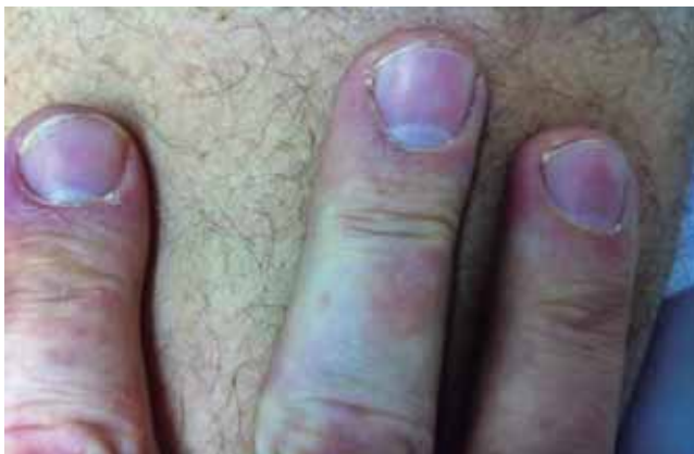
FIGURE 2: Purpuric papules on the distal ends of the right-hand fingers