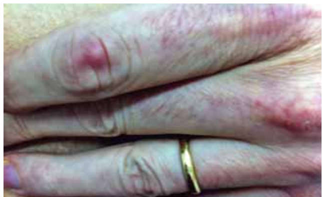
FIGURE 3: Erythematous-violaceous papule on the proximal interphalangeal joint of the left second finger