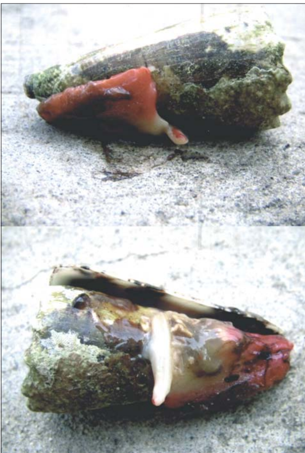
Figure 2 - A live specimen of Conus of Mozambique - Indian Ocean - showing the proboscis (probable Conus imperialis ).