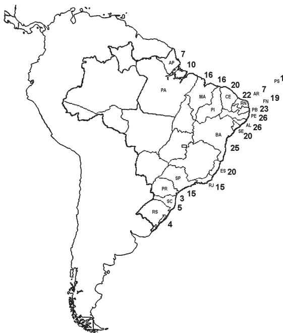
Figure 2. Number of species of Mithracinae by state along the Brazilian coast. For abbreviations see Table 1.

The dendrogram indicated three groups (A, B, and C) (Fig. 3). The “A” group was represented by the states of Paraná, Santa Catarina and Rio Grande do Sul, showing 15% similarity with the “B” or “C” groups.