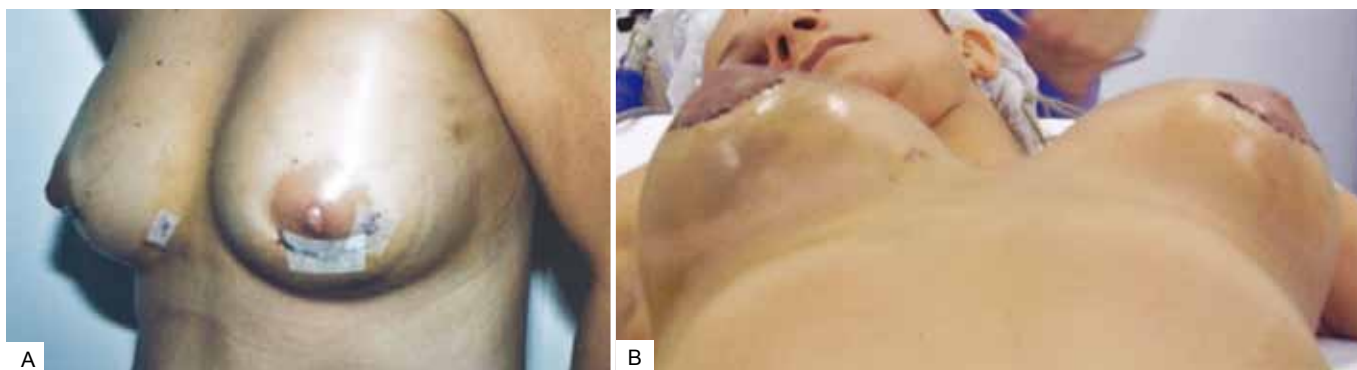
Figure 1 – A: Hematoma in the left breast. B: Bilateral hematoma on the thirteenth postoperative day of augmentation mammoplasty.

At the time of discharge, all the patient's laboratory tests were normal, with the following exceptions: ristocetin cofactor activity: 23% (N: 56–187%), and vWF antigen: 20% (N: 50–150%).