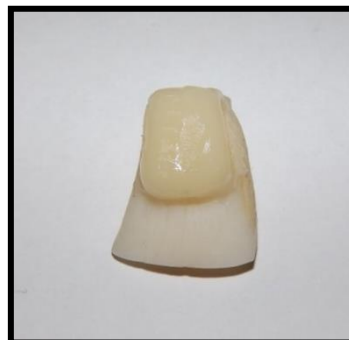
Figure 1: Resin-composite block adhered to the upper treated tooth surface.

Based on the adhesive system, the specimens were separated into the following groups: (a) Adhesive Single Bond 2 (conventional)-unbleached and bleached enamel; (b) Adhesive AdheSE (self-etching)-unbleached and bleached enamel; (c) Single Bond Universal (Universal)-unbleached and bleached enamel. These resins were chosen because they are widely used in dental clinics (mainly in Brazil) and the brands are market leaders. The teeth submitted to bleaching were restored after a period of 21 days. The resin composite/nanoparticle blocks (Figure 1) were prepared with Filtek Z350 XT, color A3 (8x4x4 mm length, width, and height), and the desired adhesive was used on the treated tooth surface. The restorative procedure was performed according to the step-by-step incremental technique, during which every 2-mm-thick layer was submitted to light curing for 20 s (LED, Radium, SDI, USA, nominal power = 1,200 mW cm -2 ).