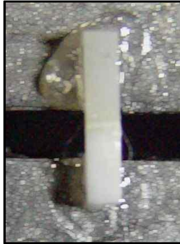
Figure 2: Sticks obtained from the teeth/restoration resin interface cuts attached to the microtensile holder.

After the sample was fractured by traction, the specimen was removed from the device, and the cross-section of the fracture plane was measured with a digital calliper (STARRET 727-6/150, São Paulo, SP, Brazil). The obtained kilogram-force (kgf) values were converted to MPa by using equation 1.