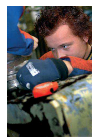
Fig. 4 – Expert doing a visual inspection.

According to (METSO, 2010), this type of inspection are done by experts who are trained to visually check for many types of problems including surface rust, scaling (paint lifting away, showing a rough not-clean surface), and signs of cladding buckling (bumps when looking down a straight line or putting a straight edge up to the headbox apron). Testing is needed not just on cast iron surfaces but also on stainless steel. If a stainless part is not kept clean there will eventually be some visible surface corrosion and pitting. Fortunately corroded stainless only requires surface cleaning and conditioning to be renewed.