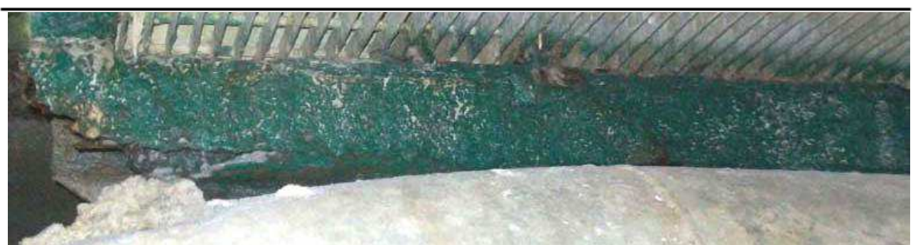
Fig. 6 - The end of this walkway support is entirely corroded through and much of the material is completely gone. There is also delamination in process on other parts of the support. This part will need to be replaced.

Special tools like caliper micrometer, hand grinders and others are used to support the professional of visual inspection to optimize his work, saving time and reducing the error probabilities.