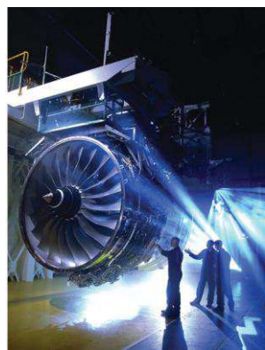
Fig. 9 - NDT is an essential tool in the aerospace industry (NON DESTRUCTIVE, 2011)