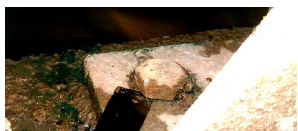
Fig. 5 - In this mill there were lock washers which had corroded away. Any fasteners that have failed should be replaced with stainless steel lubricated if they were mild steel standard fasteners.

Other important aspects to notice during a visual inspection include missing or corroded-away washers (Fig. 4), and the condition of bolts. Bolts made of mild steel will delaminate over time. Attention must also be paid to those parts of the machine that are only used in special circumstances, such as changing machine clothing. Removable block finished surfaces may not mate properly when installed, resulting in vibration. Cantilever beams have rods going to supports. These rods are typically mild steel and may become corroded. This can be disastrous because when changing a fabric, these rods are all that hold up the section.