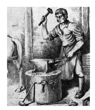
Fig. 1 – Early Blacksmith

In ancient times, the sound of the blade of the sword of Damascus would be a strong indication of how the metal would be in combat. This approach was also used by bell's makers. Hearing the sound of the bell, the sound of metal could be established in a very general way. This same "sonic" technique has been used for decades by blacksmiths as they heard the sound of different metals that were being formed. (SOUZA, 2010)