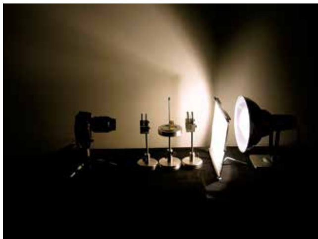
Figure 1 - Circular polariscope.

The fringe orders were verified around the canine, considering the sequence of colors produced in photoelastic material submitted to the increasing application of load and observation in the dark-field white-light polariscope (Table 1). 12 It is possible to observe that values of