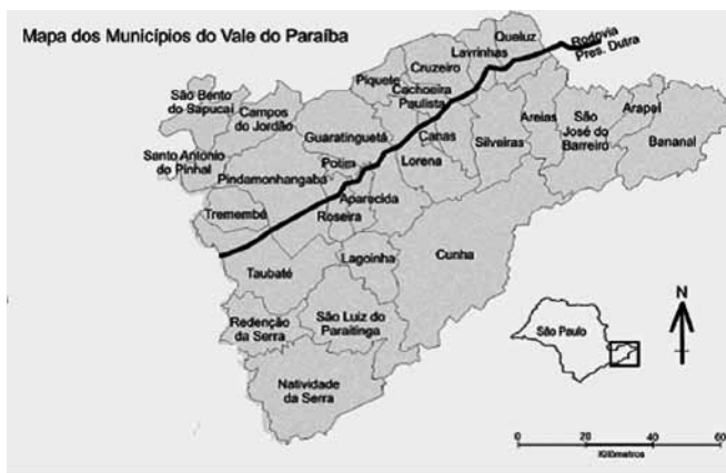
Figure 1 - Map of the municipalities in the Vale do Paraíba, state of São Paulo

The spatial statistical treatment was performed with the aid of Terraview software, provided by INPE, and employed a georeferenced database of the municipalities and the analysis by area technique to obtain the Moran Global indices, (I), first order autocorrelation and Pearson's correlation coefficient, (r), which are expressed, respectively, by: