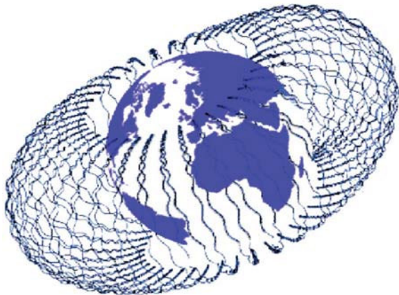
Fig. 2 Shelter formation around the Earth.

If all ionospheric electrons at the altitude of 100 \text{ km} (at the dayside) are accelerated up to quasirelativistic - relativistic energies, an expected upward electron flux directed along magnetic field line is \Phi=0.5 n c \approx 10^5 \square 3 \cdot 10^{10} \approx 10^{14-15} \text{ 1/cm}^2 \text{ s} . It is also possible that not all electrons escape simultaneously from the plasmoid and its flowing will continue for 3 hours of antenna operation. Then, flux \Phi \sim 10^{10-11} \text{ 1/cm}^2 \text{ s} , i.e. it is still very great. The shelter covered by electron fluxes is fine, with a width of about 20 \text{ km} , which a LEO satellite passes for 3 seconds.